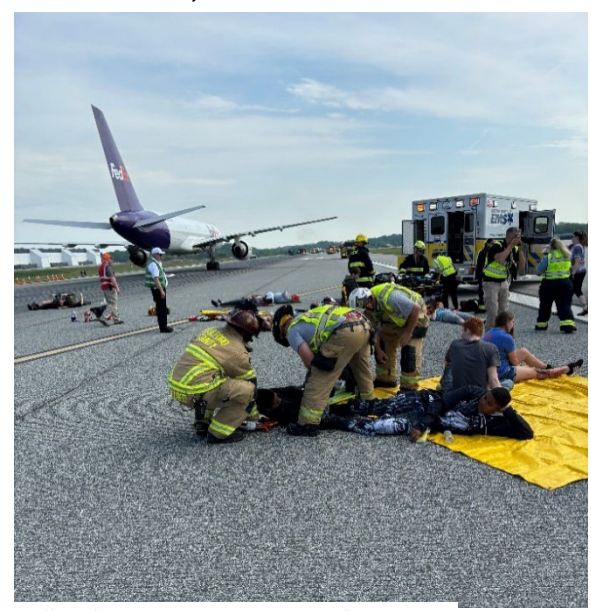
Full scale exercise at PTIA - April 20, 2024