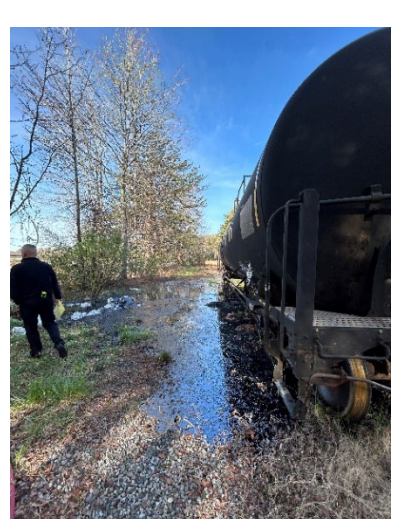
Tar spill from railcar – March 25, 2024

According to current data, Guilford County has 14 Risk Management Program (RMP) facilities, 232 Tier II facilities with Extremely Hazardous Substance (EHS) chemicals, 31 Toxic Release Inventory (TRI) facilities with EHS chemicals, and 547 facilities with Tier II submissions. This was an increase of 27 facilities from the previous year. There are 67 facilities identified as Small Hazardous Waste Generators and 59 facilities identified as Large Hazardous Waste Generators in the county.