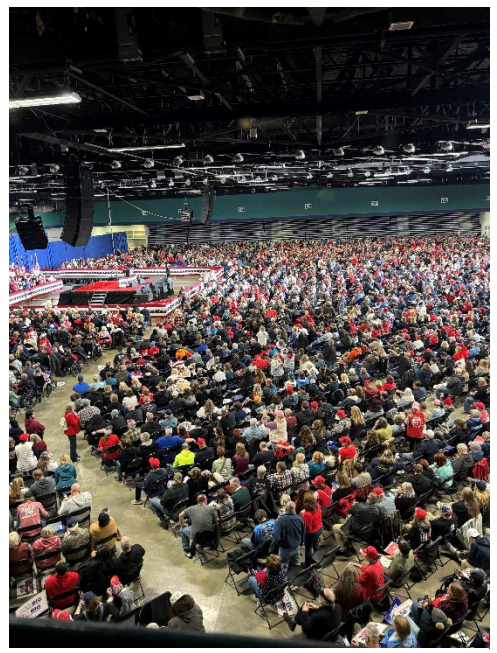
Presidential Candidate Rally - March 2, 2024

With 2024 being a presidential election year, Guilford County experienced multiple candidate visits. One event was a presidential rally at the Greensboro Coliseum on March 2, 2024. Guilford County Emergency Management along with Guilford County EMS, Greensboro Fire Department, and Greensboro Police Department provided emergency services during the rally. In coordination with the United States Secret Service, over 6,500 event goers were provided security, fire protection, and medical services. During the event, EMS treated multiple patients for various emergent medical conditions. The coordination of all agencies proved valuable in providing excellent emergency services to the attendees.