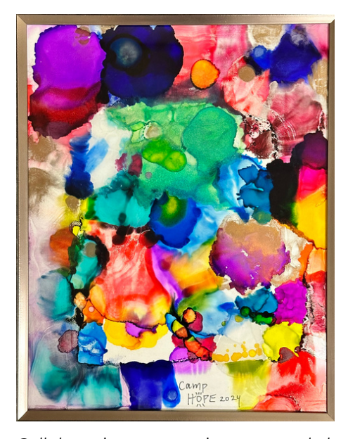
Collaborative art project created by campers using creativity to combine colors and spark with fired alcohol ink to make something beautiful.

The FJC Youth program, including Camp HOPE, would not be possible without the generosity of our community. A week of classic overnight camp costs $750 per child, and high adventure camp costs $950 per teen. All participants attend at no cost to their families. More than 3,000 annual volunteer hours ensure the program's success.