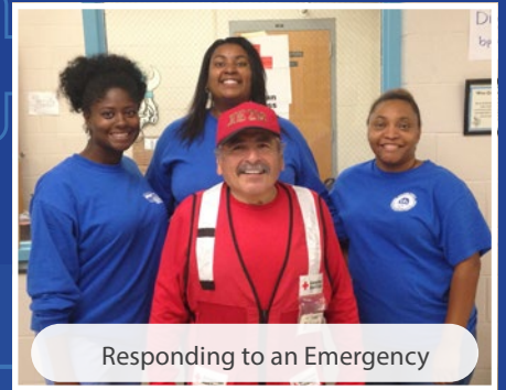
Responding to an Emergency