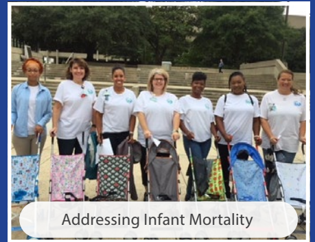
Addressing Infant Mortality