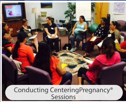
Conducting CenteringPregnancy® Sessions

FOR ALL THE WAYS THEY KEEP OUR COMMUNITY HEALTHY!!