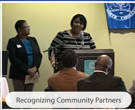
Recognizing Community Partners