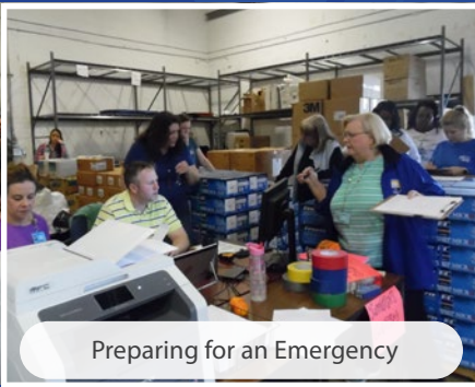
Preparing for an Emergency