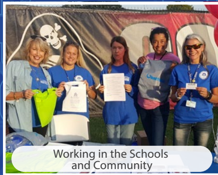
Working in the Schools and Community