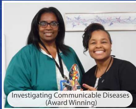
Investigating Communicable Diseases (Award Winning)