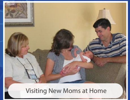
Visiting New Moms at Home

Our nurses care for our residents throughout their entire lifespan. We are proud of our Public Health Nurses, their dedication and their commitment to serve.