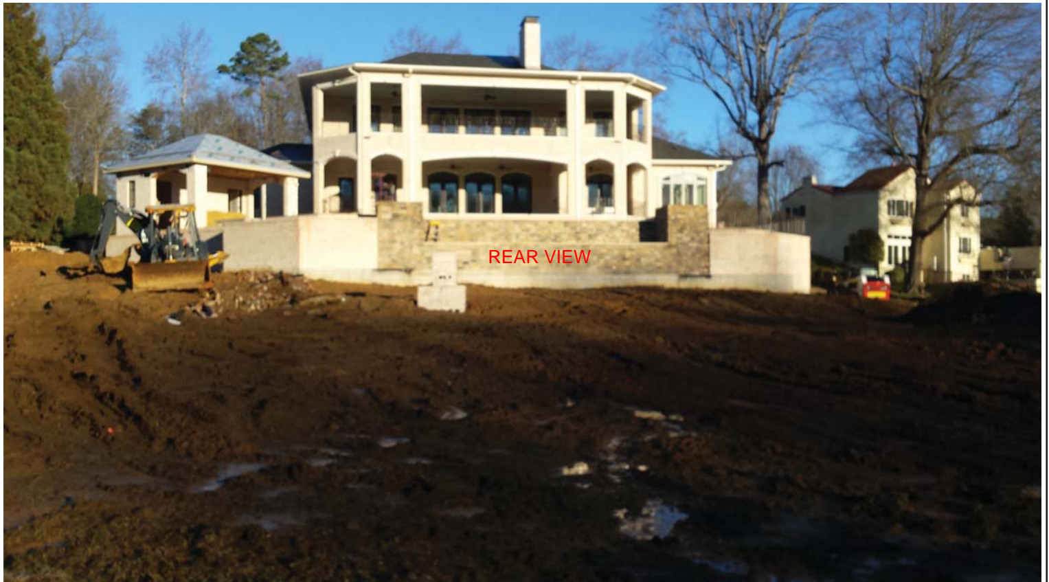
Building photograph #2