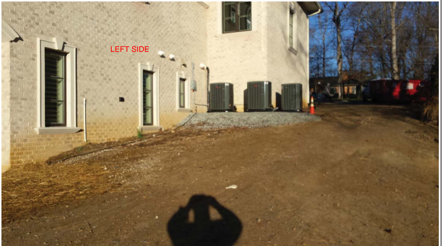
Building photograph #4