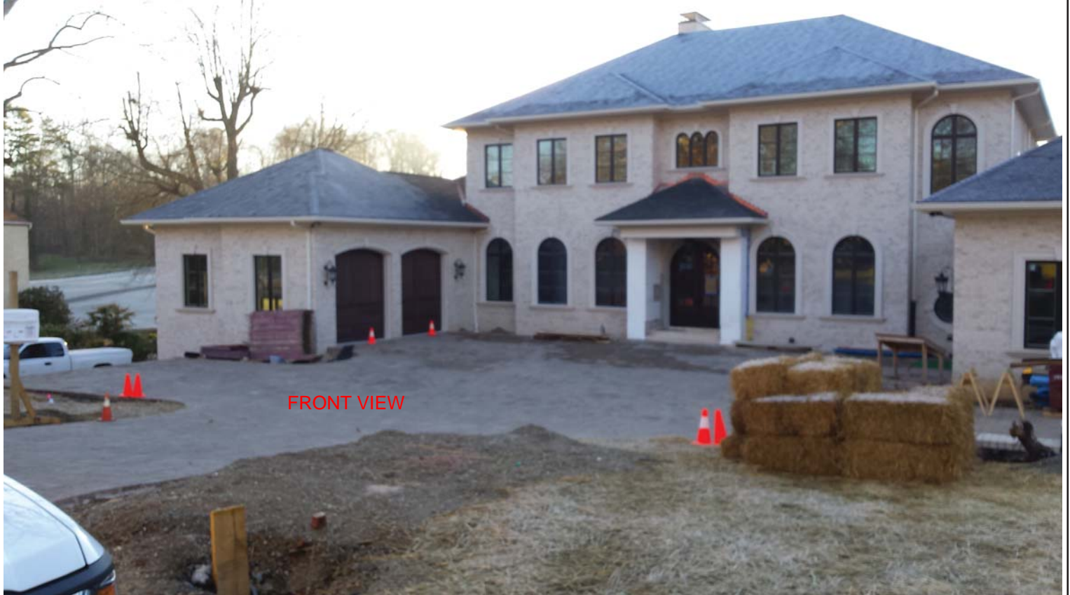
Building photograph #1

If using the Elevation Certificate to obtain NFIP flood insurance, affix at least 2 building photographs below according to the instructions for Item A6. Identify all photographs with date taken; "Front view" and Rear view"; and, if required, "Right Side View" and "Left Side View." When applicable, photographs must show the foundation with representative examples of the flood openings or vents, as indicated in Section A8. If submitting more photographs than will fit on this page, use the Continuation Page.