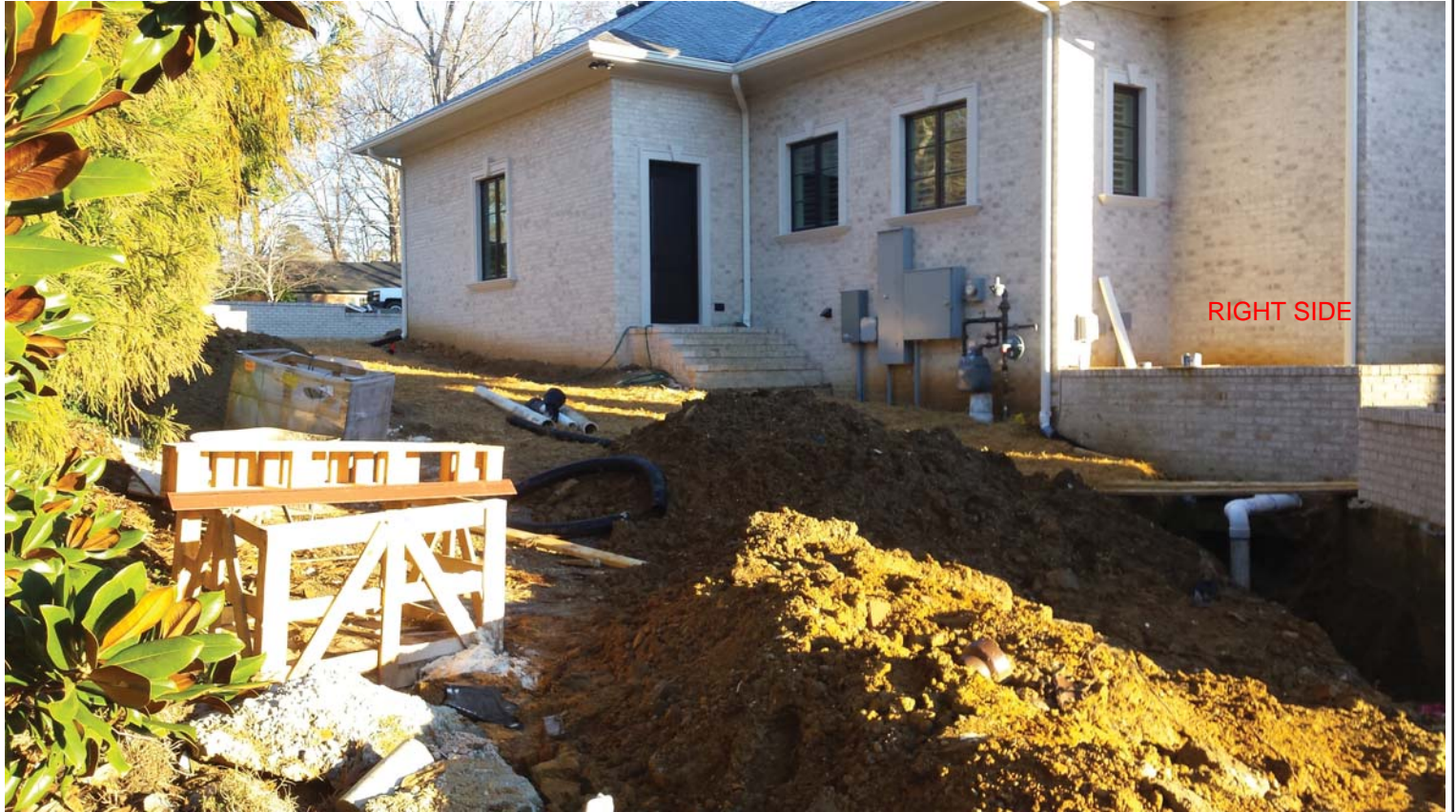
Building photograph #3

If submitting more photographs than will fit on the preceding page, affix the additional photographs below. Identify all photographs with: date taken; "Front View" and "Rear View" and, if required, "Right Side View" and "Left Side View." When applicable, photographs must show the foundation with representative examples of the flood openings or vents, as indicated in Section A8.